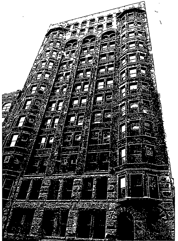
537 S Dearborn - Front - 2 Bay Window 15 x 26 x 36