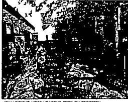
VIEW LOOKING NORTH (EXISTING TRELLIS ON PROPERTY)