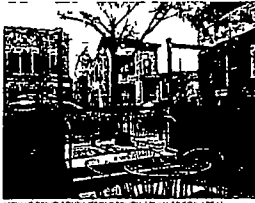
VIEW LOOKING SOUTH (EXIST. BENCH / PLANT & SOIL AREA)