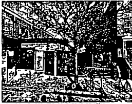
VIEW LOOKING NORTH (EXIST. FACADE / PARK AREA)