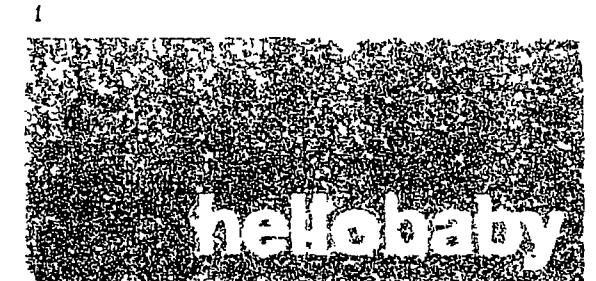
Logo - 16 183