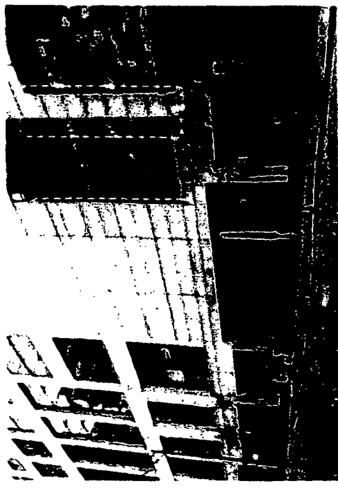
UPPER: 48" x 120" (12' x 30')