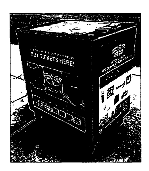
TYPICAL PORTABLE KIOSK 2.95' LONG x 2.17' WIDE x 3.58' HIGH