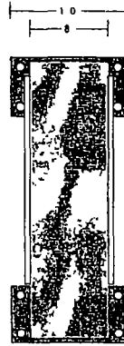
Side View 1 1/2" = 1'-0"

▶ ONE DOUBLE FACE SIGN/ INTERNALLY ILLUMINATED WITH LED & ROUTED ALUCOBOND WITH 3/4" MILK WHITE PUSH THRU LOGOS/ COPY IS ROUTED AND BACKED WITH WHITE PLEX/ FLAG MOUNT TO BRICK FASCIA WITH 1" STEEL TUBE AND MOUNTING PLATES/