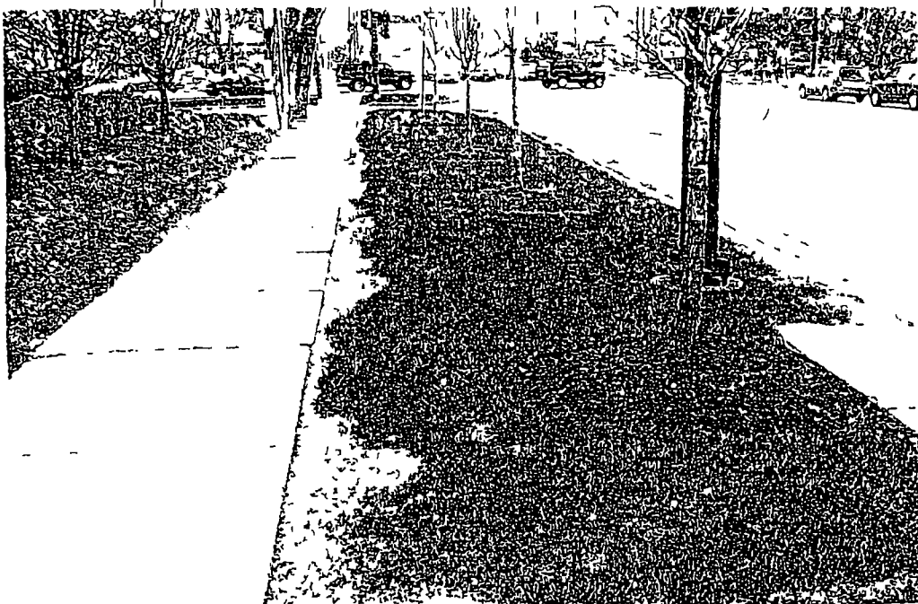
VIEW LOOKING NORTH ON CUMBERLAND FROM 5450 N. CUMBERLAND TO CATALPA