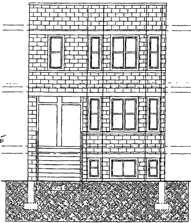
2 EXIST'G OPEN CONCRETE PORCH FRONT ELEVATION SCALE 1/4" = 1'-0"