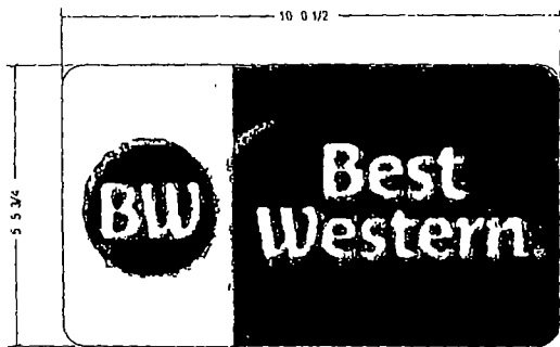
(A) (B) TWO (2) SINGLE SIDED INTERNALLY ILLUMINATED WALL SIGNS SCALE 1/4" = 1'