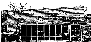
1 EXISTING CONDITIONS SCALE NTS

DO NOT DESTROY EXISTING SIGNS LANDLORD REQUESTS CURRENT SIGNS TO BE SALVAGED