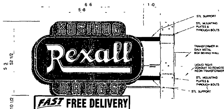
ONE (1) D F ILLUMINATED BLADE SIGN DISPLAY 1/2" = 1'-0"