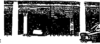
GREEN STREET ENTRANCE