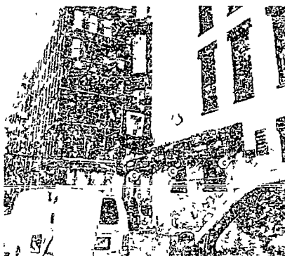
Hubbard St. Awning