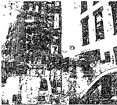
Hubbard St. Awning ONE - HUBBARD ST. CHICAGO, ILL. 60610 SIGNED BY: [Signature] DATE: 5/10/00 RE: FLOOD LIGHTS ON EXTERIOR WALL AWAY FROM BUILDING FACE TO PREVENT FIRE HAZARD. SEE CITY CODE. ALL FLOOD LIGHTS TO BE REMOVED AND REPLACED WITH NEWER, LOWER VOLTAGE FLOOD LIGHTS. PROJECT # 441099 F LEA PAGE 480V CR-02