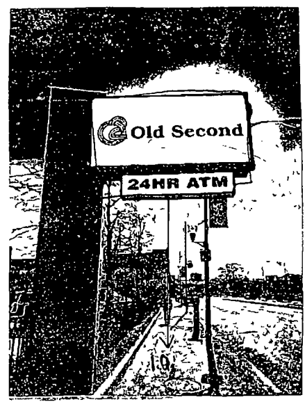
Proposed New Faces