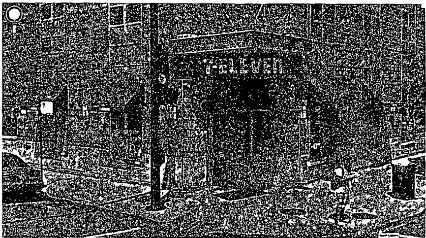
SIX(6) EXTERNAL L.E.D. ILLUMINATED WALL MOUNTED LIGHT FIXTURES