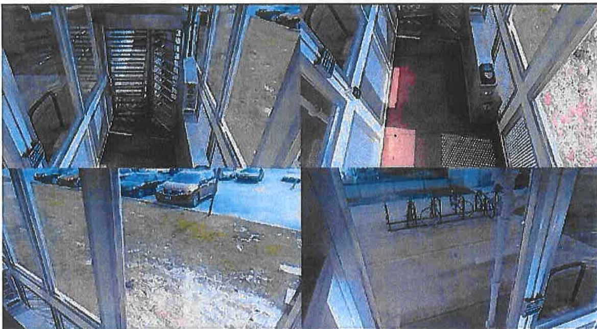
New 360 Degree Camera Angles – 35 th /Bronzeville/IIT Green Line Station