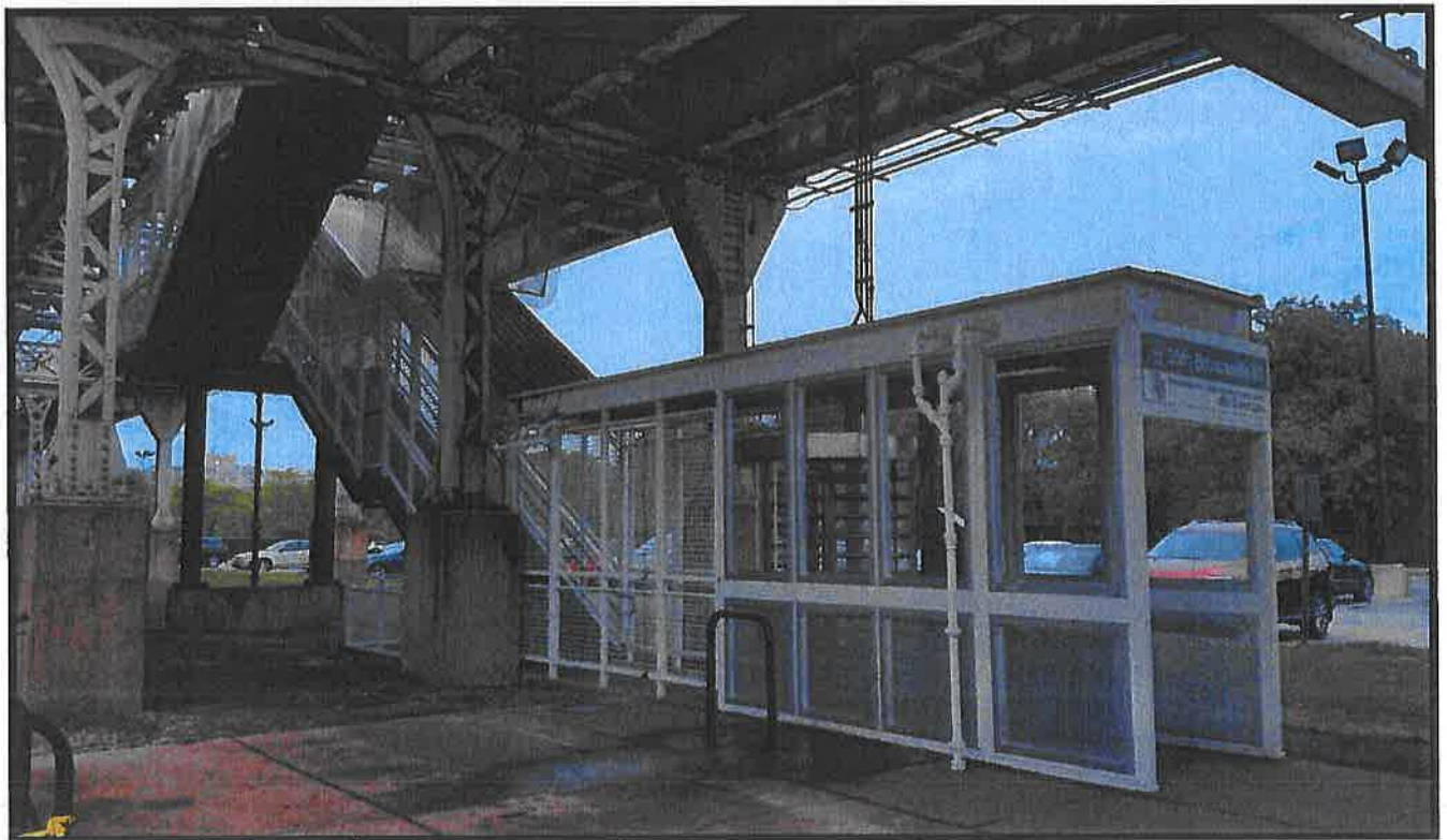
35 th /Bronzeville/IIT Auxiliary Station Entrance - After