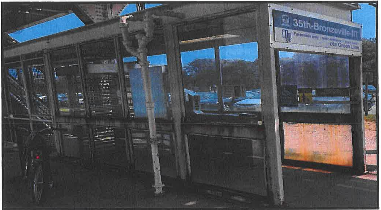
35 th /Bronzeville/IIT Auxiliary Station Entrance - Before