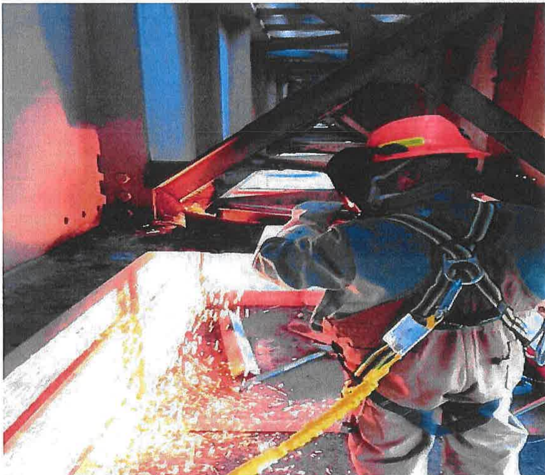
Flange Angle Replacement – Green/Pink Line West