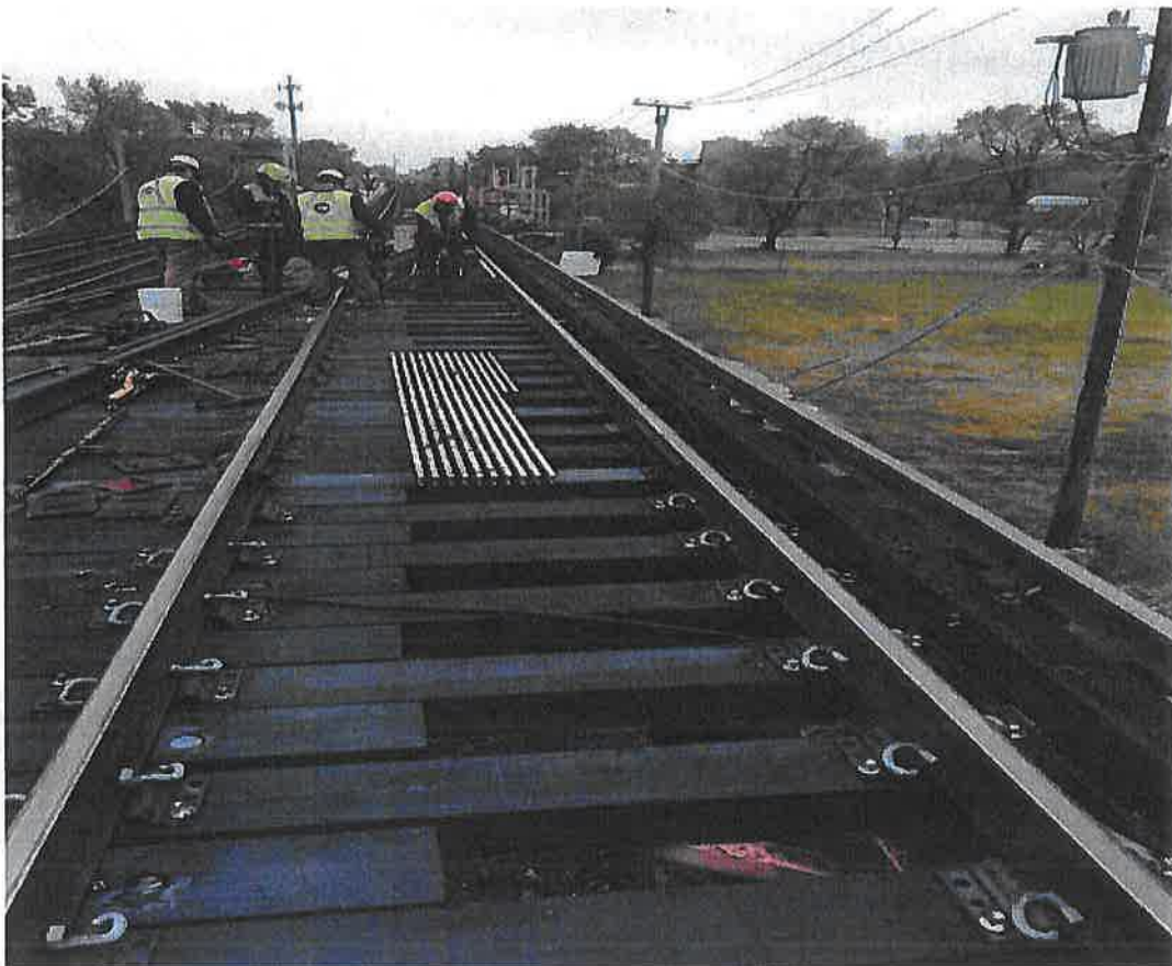
Tie Replacement – Green Line South