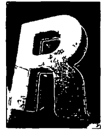
EXAMPLE OF LETTERS

FABRICATE &amp; INSTALL (1) ONE SET OF INTERNALLY ILLUMINATED CHANNEL LETTERS