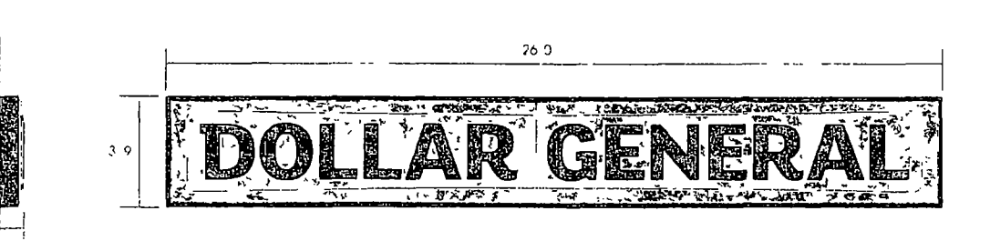
Business (d no 2828050