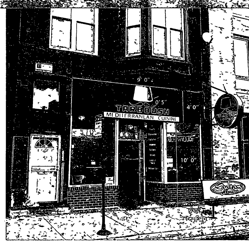
NOTE Photo for representational purposes only Signs are not to scale and may appear larger or smaller than shown