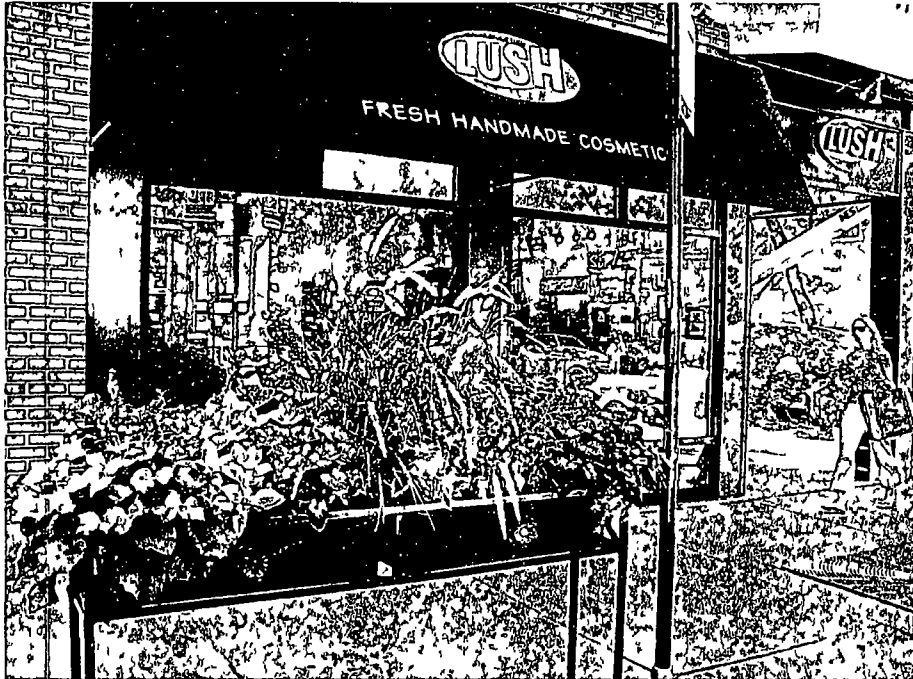
859 W Armitage