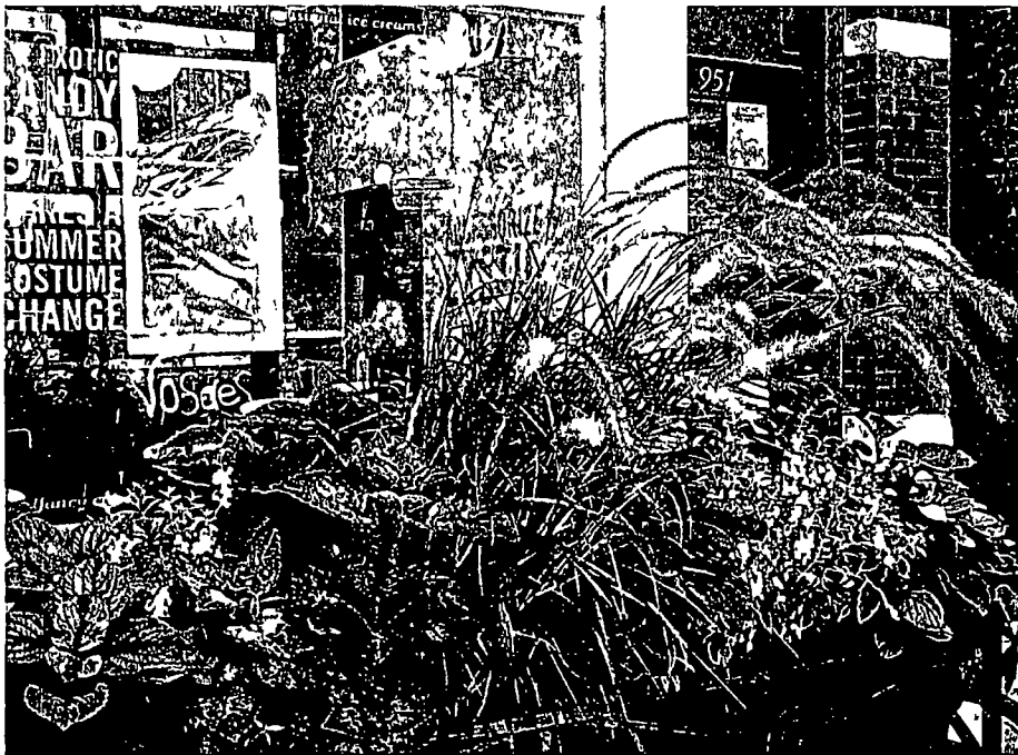
951 W Armitage