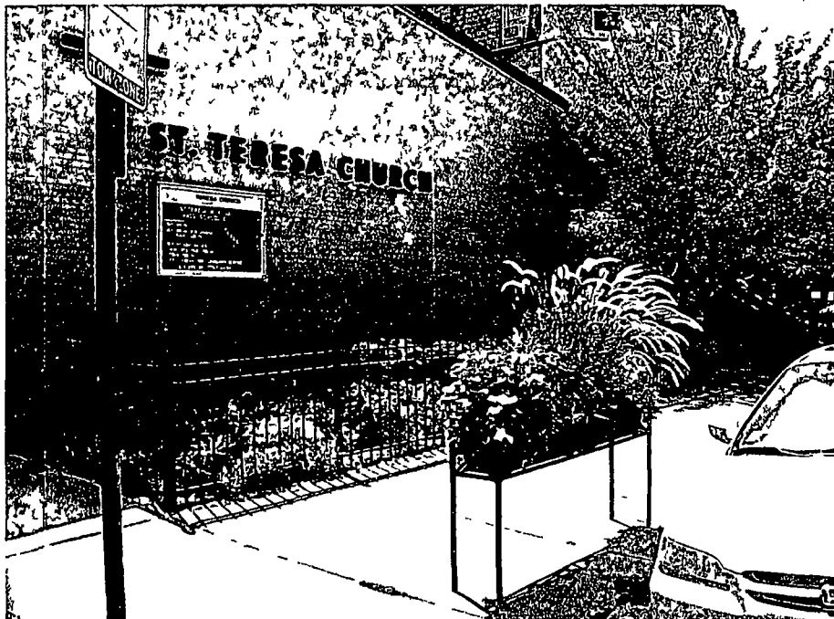
1037 W Armitage