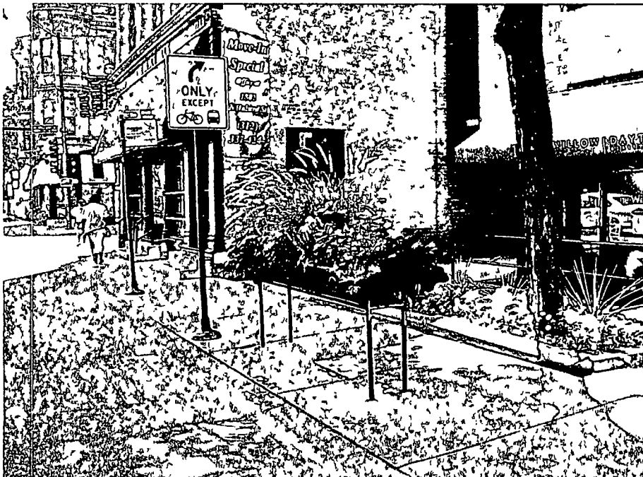
1802 N Halsted