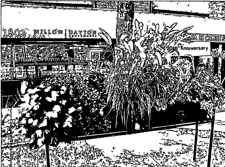
1802 N Halsted