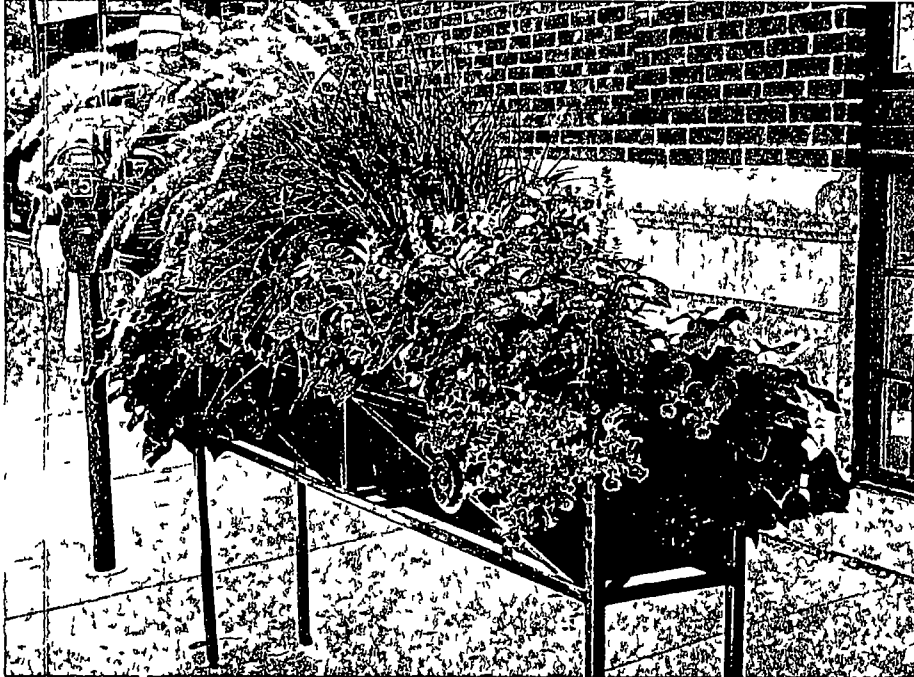
1970 N Halsted