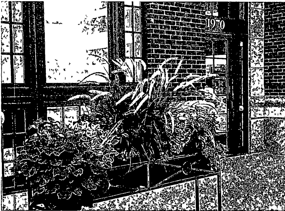
1970 N Halsted