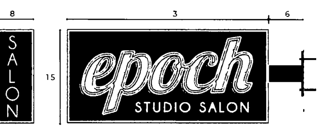
Signage On Lot 58 sq ft

Qty 1 Illuminated Projecting Blade Sign Copy on 3 sides 40 lbs 4sqft C1 2 Zone 247 Frontage