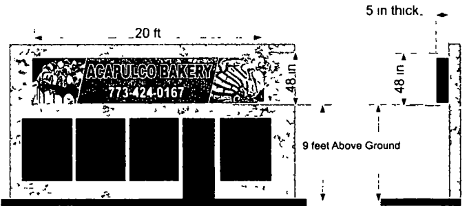
10 feet from edge of sign to curbline

SPECIFICATIONS Graphic replacement on an already existing sign. Graphic