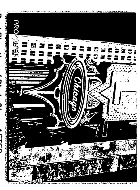
East Elevation of Blade Sign - AFTER