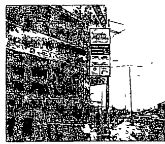
Proposed Face Elevation NTS