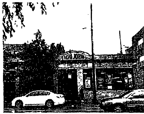
SIGN SHOWN ON 50' BUILDING FRONT