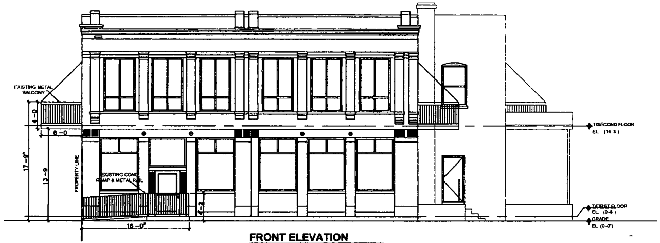
FRONT ELEVATION 3/32 = 1'-0