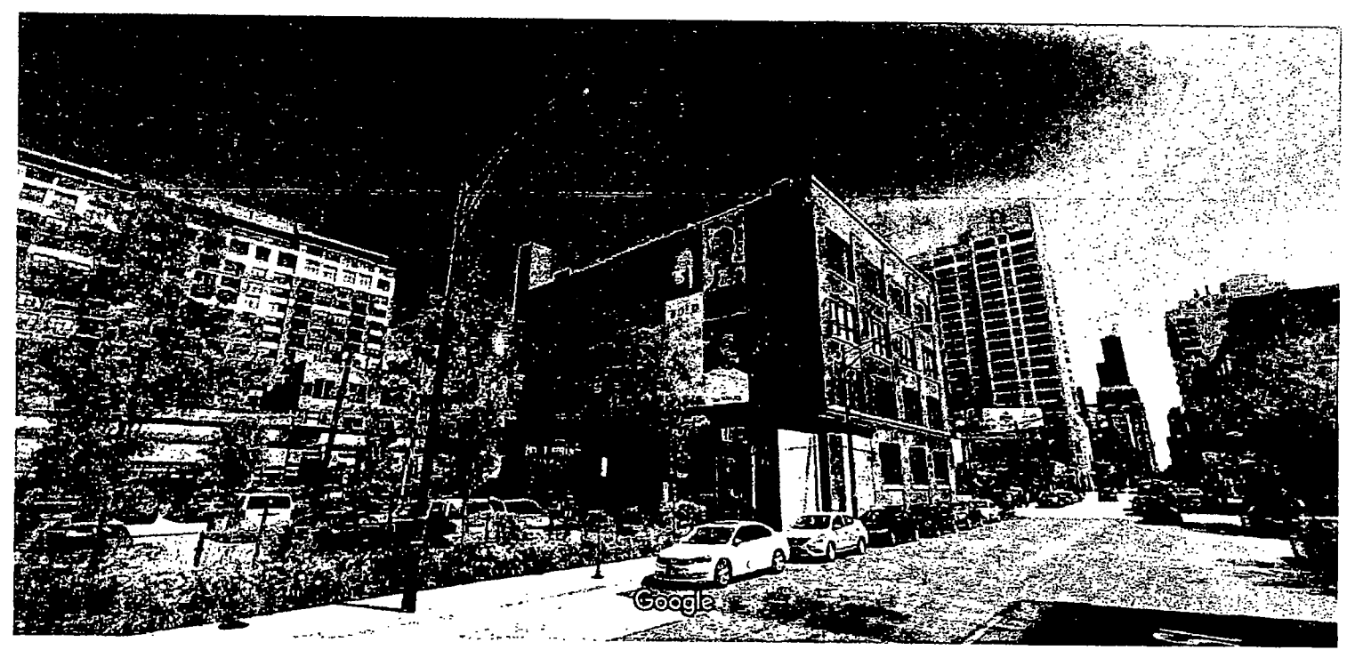
lmage capture. Jul 2018 € 2018 Google