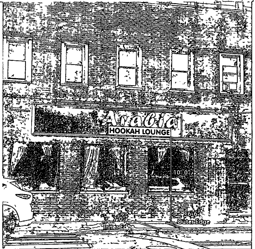
NOTE: Photo for representational purposes only. Signs are not to scale and may appear larger or smaller than shown