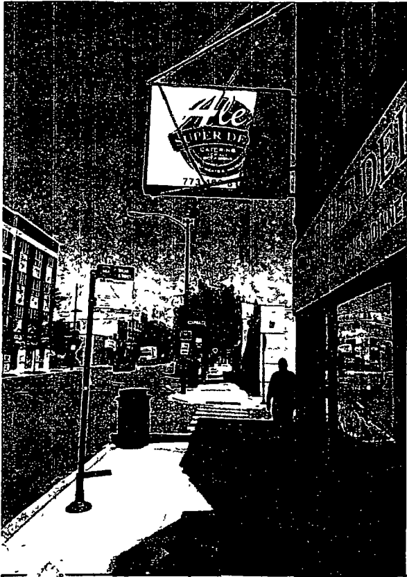
25' STORE FRONT