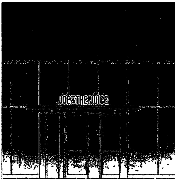
Night Appearance Silhouette Lighting