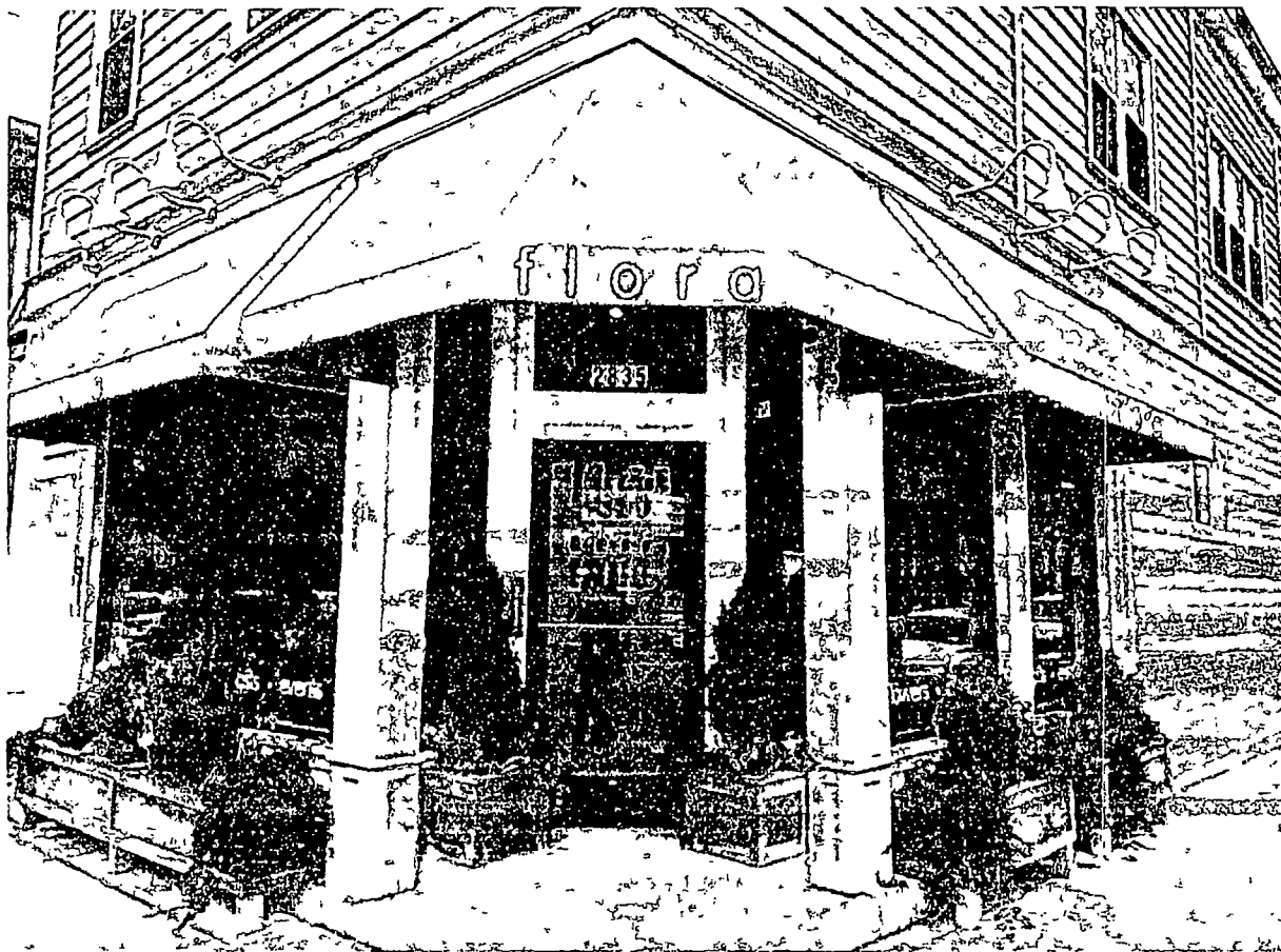
chr Southport & wolfram