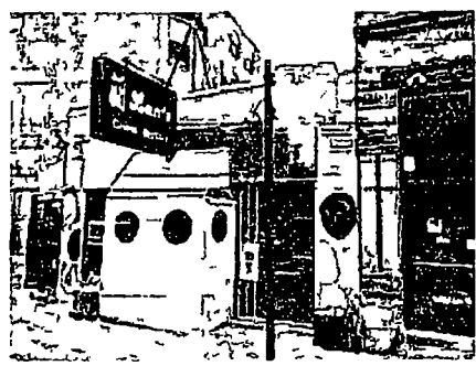
IMG_1908 jpg 116K