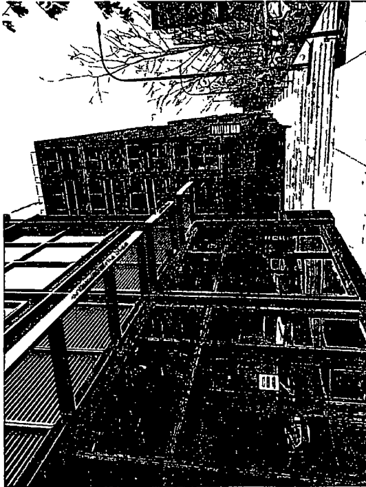
proposed layout locations approx. size & location