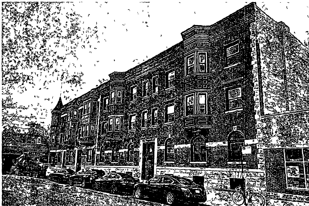
1509-1517 E 57 th Street

Account # 340636-1, PWU #1113600 Bay Windows