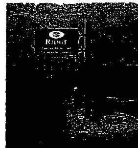
After New Proposed Signage