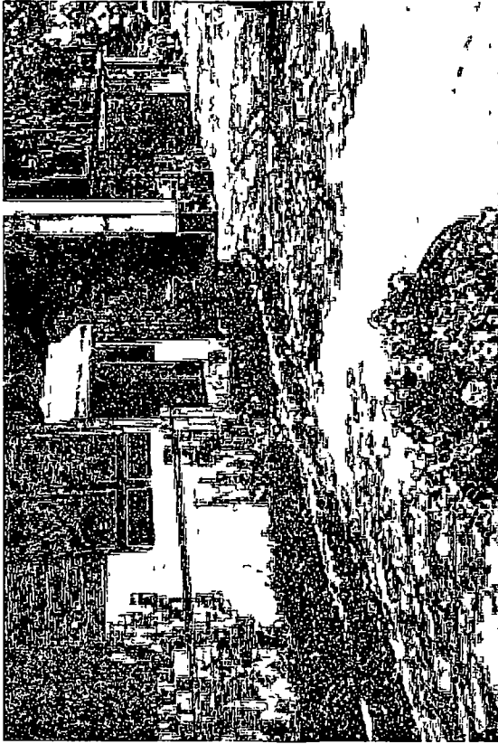
1912 W 103RD STREET