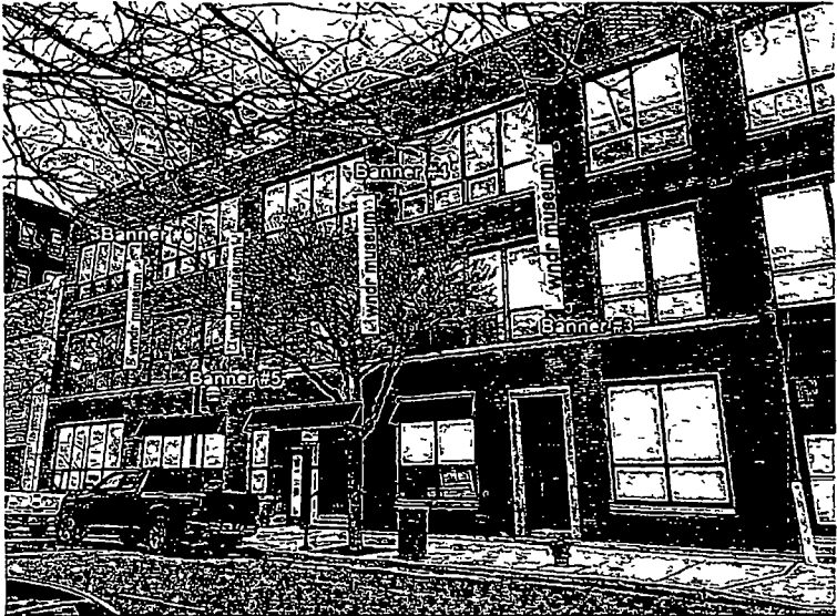
In Place Graphics