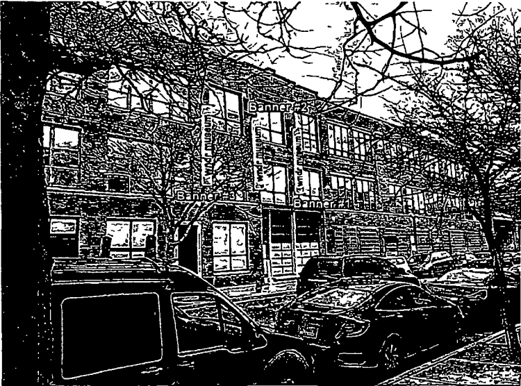
In Place Graphics