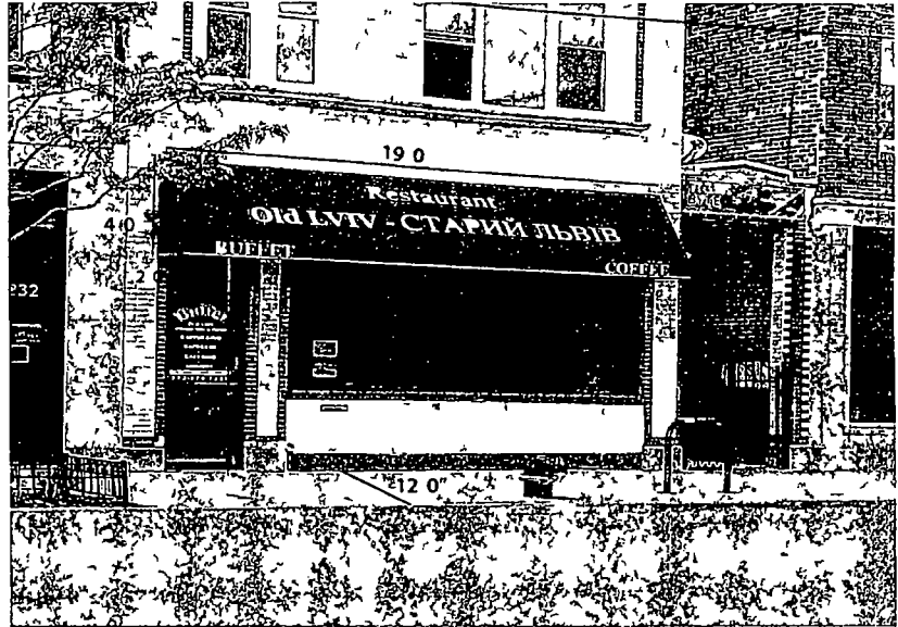
NOTE: Photo for representational purposes only. Signs are not to scale and may appear larger or smaller than shown.