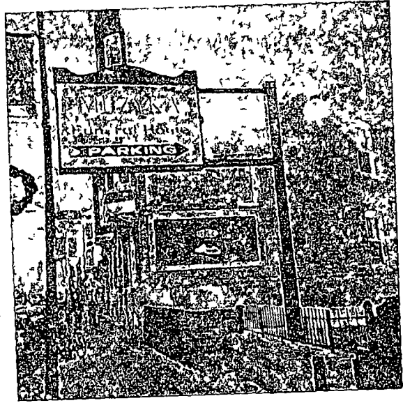
2137 West Chicago Avenue Chicago Illinois 60622-4821