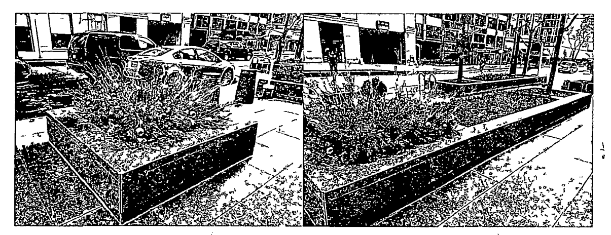
Northeast Delaware Planter 13