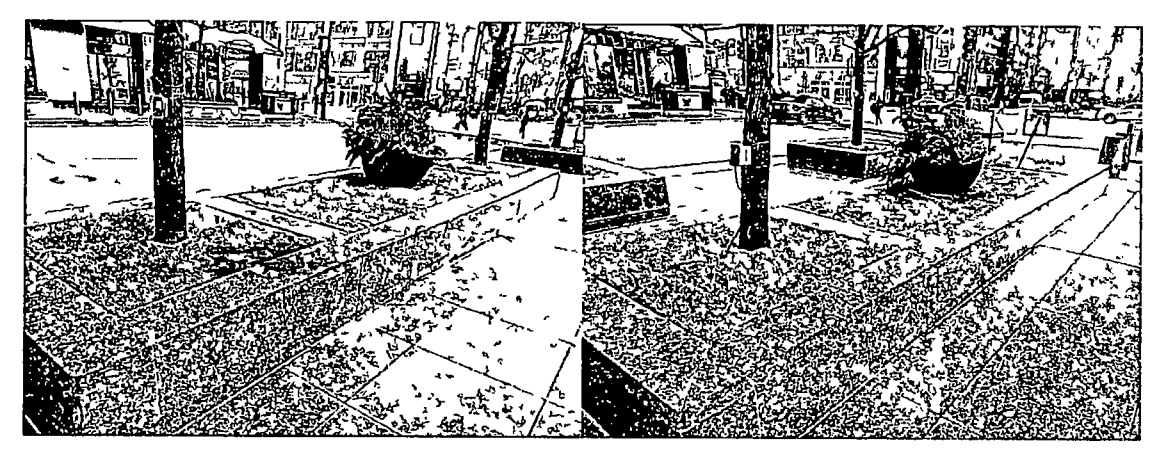
Southwest Chestnut Planter 24