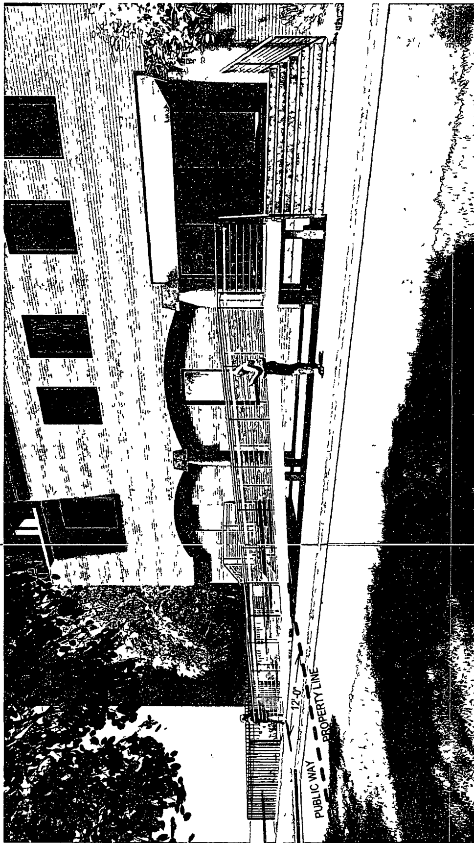
VIEW LOOKING WEST TOWARD CANAL STREET