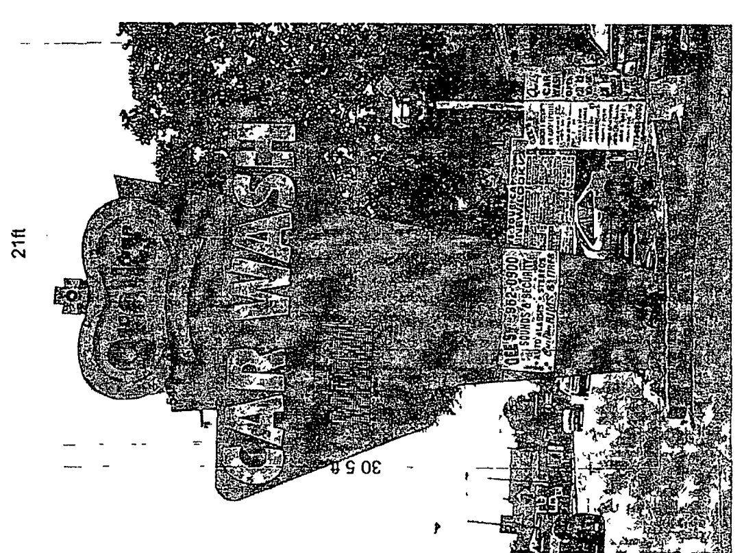
644 F 87th St Cricago IL