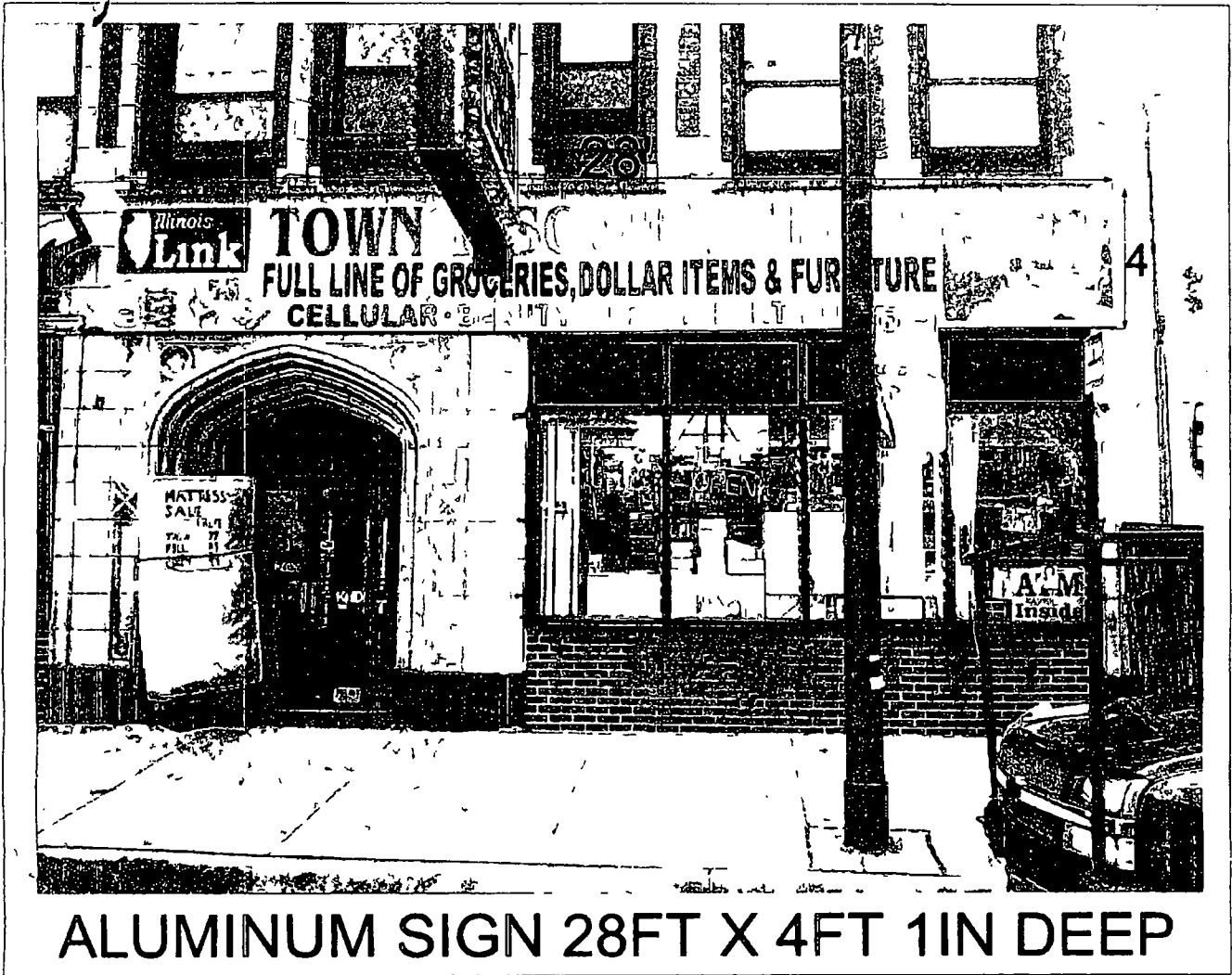
ALUMINUM SIGN 28FT X 4FT 1IN DEEP