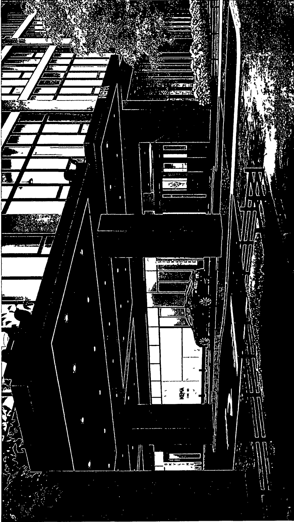
RENDERING OF CANOPY FROM INDIANA AVENUE LOOKING NORTHWEST